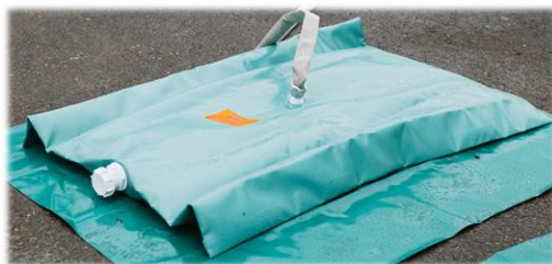
2. Closed container for collecting dirty water (300 - 1500 liters)