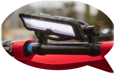
5. Lighting kit KOS-2