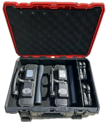
6. Adapter for connection type STORZ