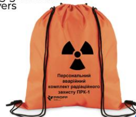
Bag for PKR