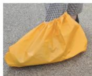
Protective shoe covers