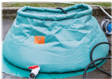
1. Open container for clean water (1000 liters)